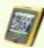
Trimble Juno GPS