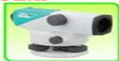
SOKKIA B Series