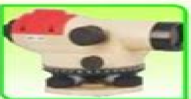
KOLLIDA KT Series