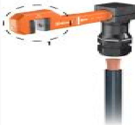
FSA20K... mit Kabelanschluss FSA20K... with connected cable