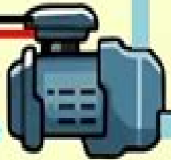
Single Phase 1HP Motor