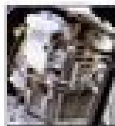
Mesin 225 cc - 4 Tak SOHC

YAMAHA SCORPIO, paduan antara kegapahan desain dan teknologi mesin yang tangguh, berani untuk tampil beda. Sebuah rancangan sempurna yang membuatnya mudah untuk dikendarai di tengah padatnya kemacetan kota.