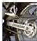
Mesinnya Lin, Stabilisasi dan Ringan Double Disc