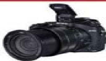
GETTING THE MOST FROM SONY'S ADVANCED DIGITAL CAMERA