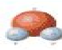
Microscopic view of an animal cell.