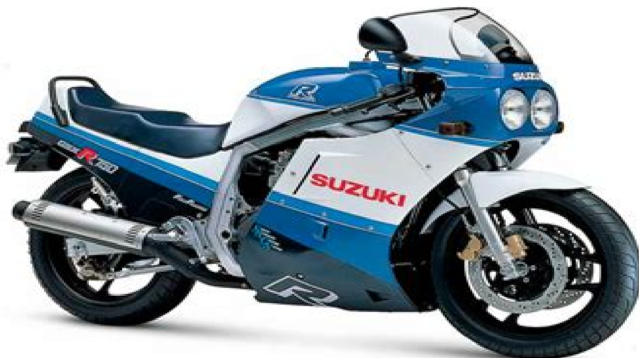
Suzuki GSX-R750 1985 - 1987