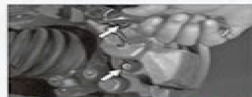
Detailed brake pad and rotor service procedure. 48 Brakes—Mechanical