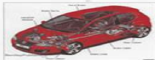
Suspension and brake components of GTI model. 02 Product Familiarization

Service to Volkswagen owners is of top priority to Volkswagen and has always included the continuing development and introduction of new and expanded services. Whether you're a professional or a do-it-yourself Volkswagen owner, this manual will help you understand, care for and repair your Volkswagen. The do-it-yourself Volkswagen owner will find this manual indispensable as a source of detailed maintenance and repair information. Even if you have no intention of working on your vehicle, you will find that reading and owning this manual makes it possible to discuss repairs more intelligently with a professional technician.