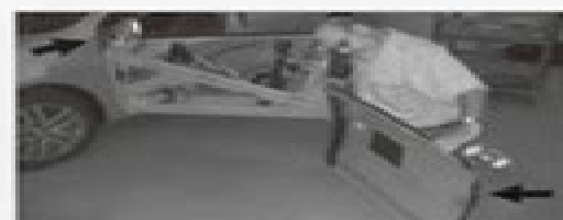
Outer door panels are removable for servicing components inside door cavity. 07 Doors and Central Locking