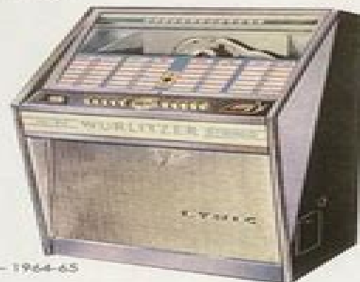
Lyric E - 1964-65