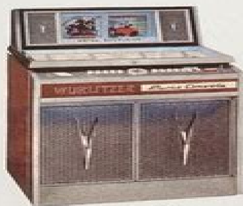
Lyric Console - 1965-66