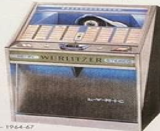
Lyric M - 1964-67