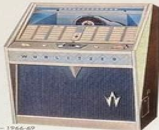
Lyric M - 1966-67