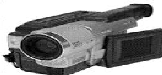
Photo : DCR-TRV130E

US Model Canadian Model Korea Model Brazilian Model