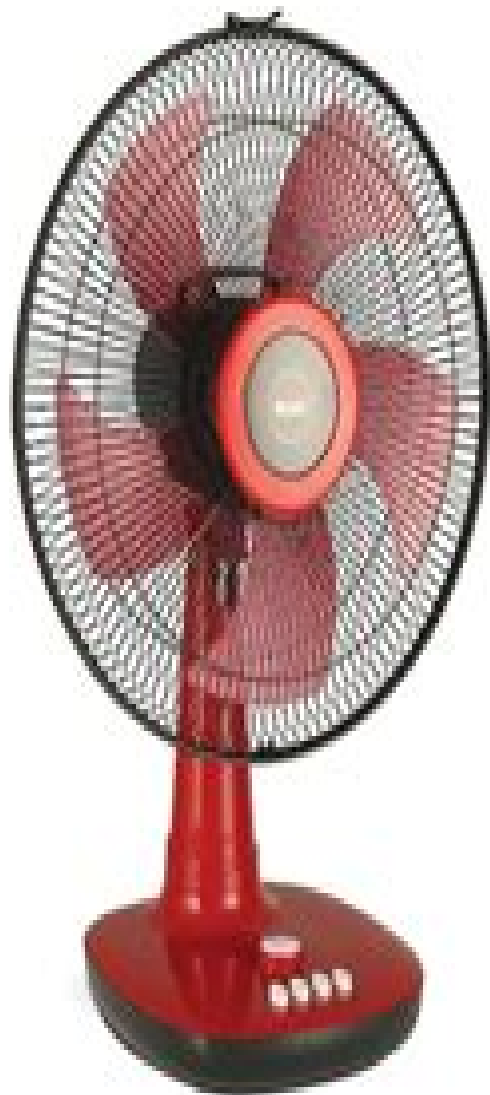
Table Fan Wiring Connection Diagram