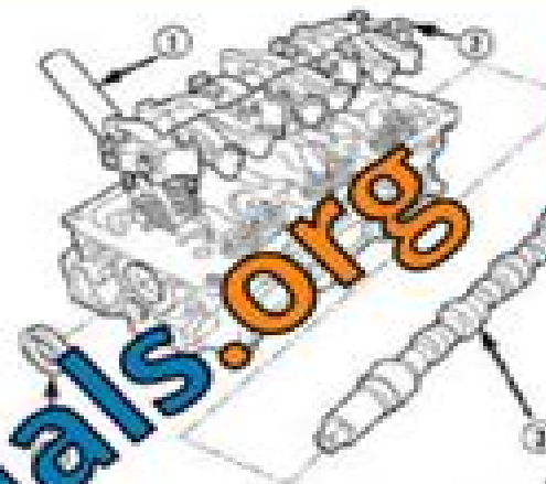
Fig. 186: Spark Plug Tube, Rocker Arm Assembly, Camshaft & Seal