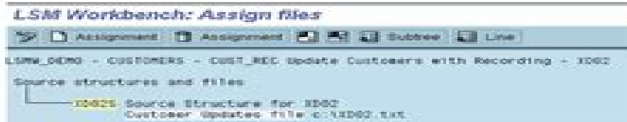
Figure 15 Assign file to Source Structure

Execute step "Assign Files" (Figure 15) and the system automatically defaults the filename to the source structure.