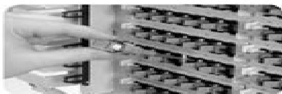
Single Fiber Access

The FL2000 system is a flexible and modular series of fiber products for today's and tomorrow's evolving communications and data networks.