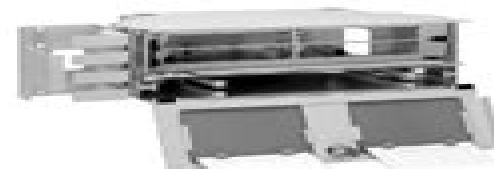
Rack Mount Termination/Splice Panel (Empty)