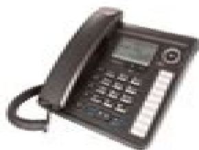
Model 7700 handset