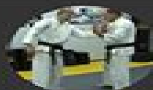
Self-Defense Sets (Goshin Jutsu) Specialized self defense techniques address chokes, holds, grabs, and weapon threats.