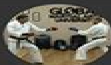
Sparring (Kumite) Sparring practice that begins with controlled one-steps, and then gradually morphs into freestyle sparring.