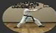
Forms (Kata) A pre-arranged fight or choreographed training sequence integrating several techniques.