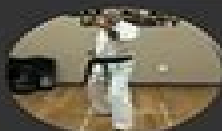
Basics (Jihon) Basic techniques such as punches, kicks, stances, and blocks.