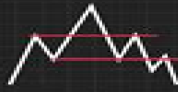
Head & Shoulder