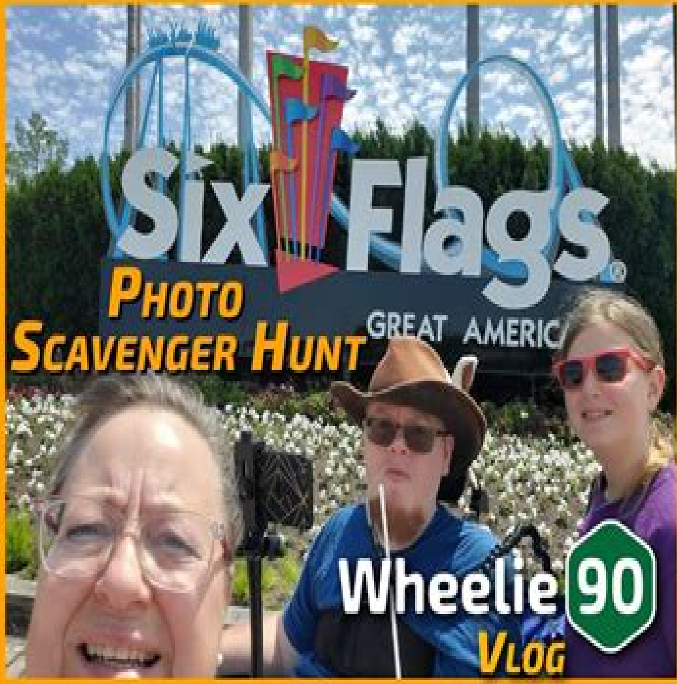
PHOTO SCAVENGER HUNT